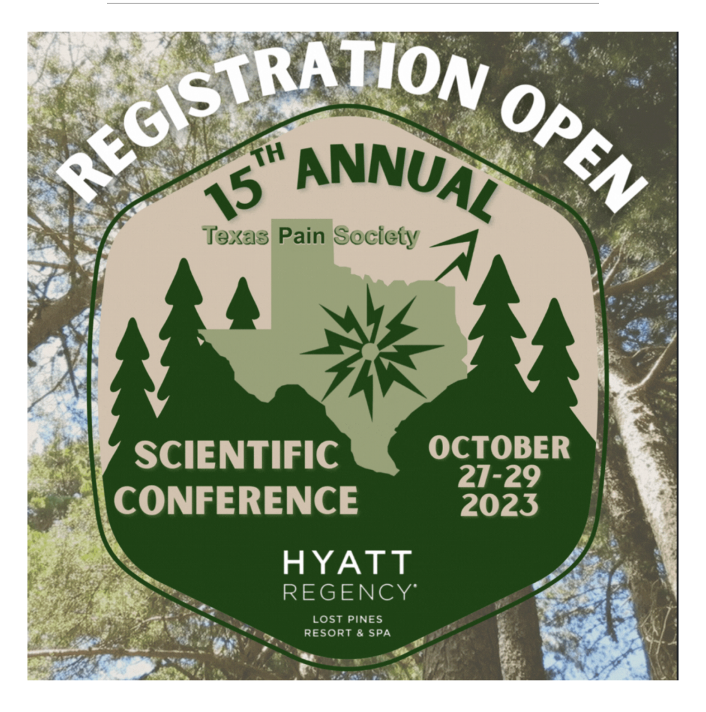
The 15th Annual Texas Pain Society Scientific Conference will be held October 27-29, 2023, at Hyatt Regency Lost Pines Resort & Spa.

Gulf Coast Consortia invites you to <u>register</u> (registration closes at midnight on October 19) for our October #Pain2023 series focusing on Mechanisms of Sensory Neuron Development . The event will occur online, on October 20, 2023, from 1-2 pm (CDT).